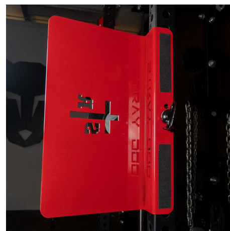
1" and 5/8" Storage Hole