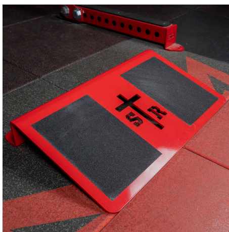
24" x 14"