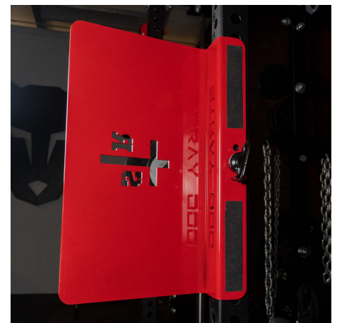
1" and 5/8" Storage Hole