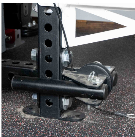
Fixed Low Pulley Can be added