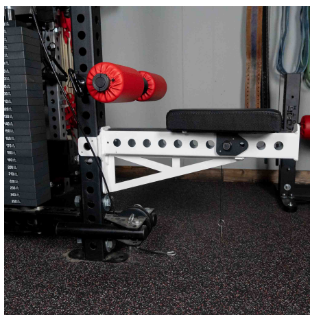
Removable Seat and Knee Hold