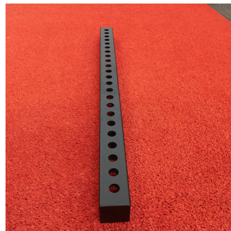
Non Offset 1" Holes on all 4 sides