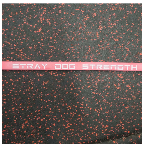
Red Band .55" wide and .1825" thick