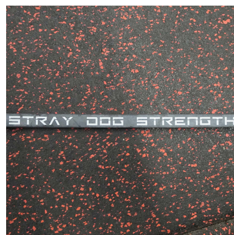
Black Band .523" wide and .25" thick