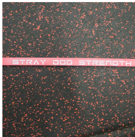
Red Band .55" wide and .1825" thick