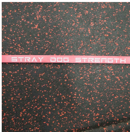
Red Band .55" wide and .1825" thick