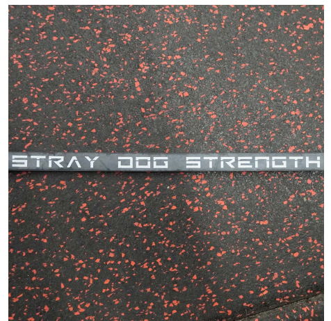
Black Band .523" wide and .25" thick