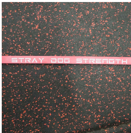
Red Band .55" wide and .1825" thick