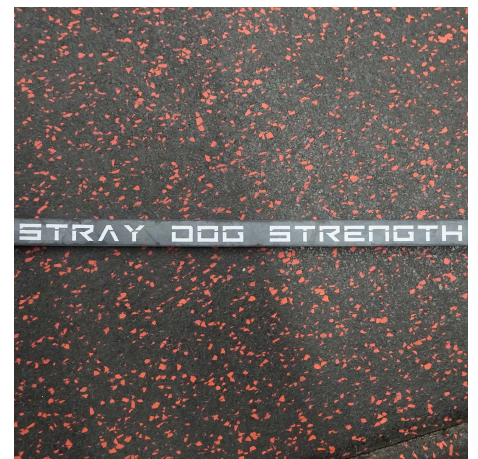
Black Band .523" wide and .25" thick