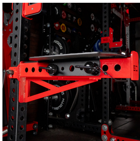
Attach to spotter arm