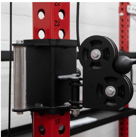
Stainless Steel Knurled Handle