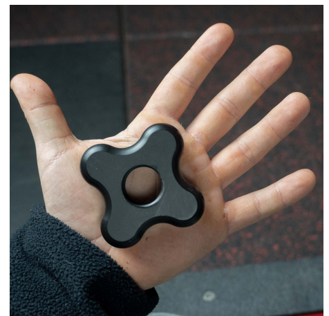
Single solid piece will not break