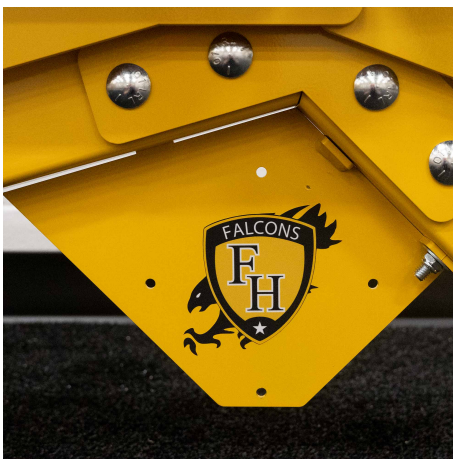
Bolt On Logo Plate