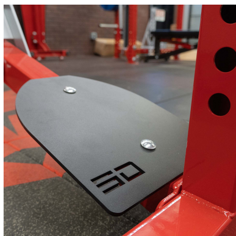
Bolt On Spotter Plate