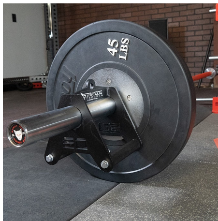
Add to Bar for Landmine Movements