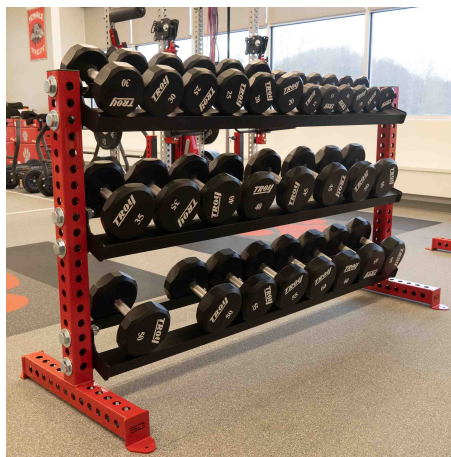
215" made of 3 72" Trays