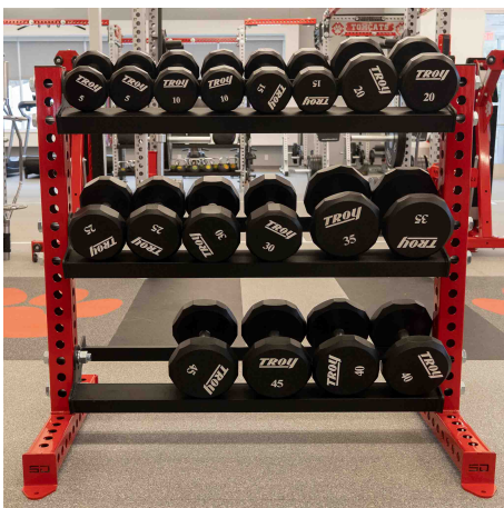
127" Made of 3 43" Trays