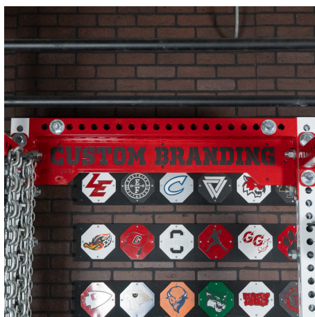
Included Custom Branding