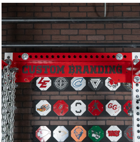
Included Custom Branding