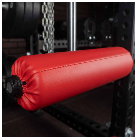
18" Long Pad