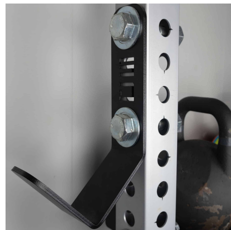
2 1" Holes 6" apart on center