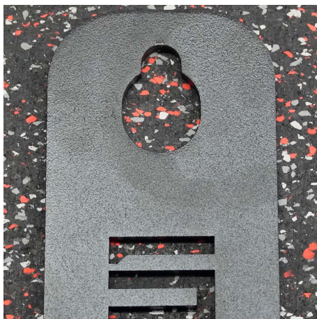
Wall Mount Hole and 1" hole