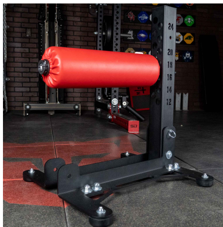
Add Any 1" Roller