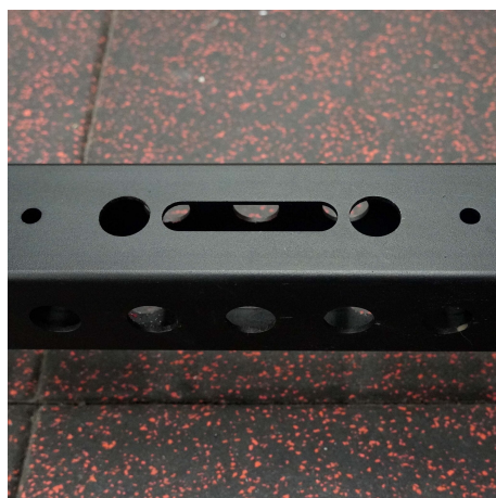
Guide rod hole pattern