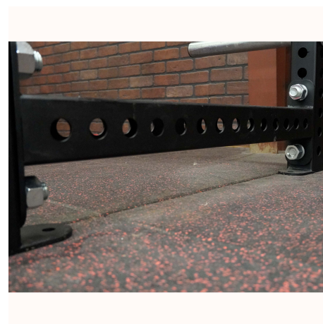
3.75" underneath for feet