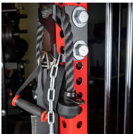
Store Anything Under 50 LBS