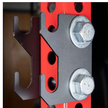
Dual Steel Plate Construction