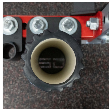
Holds single foam roller