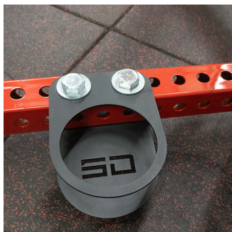
SD logo cut out