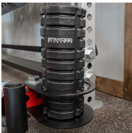
Attach with two 1" Bolts