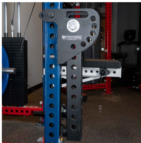
3x3" Tube with 1" holes