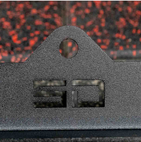
Laser Cut Logo and Carabiner hole