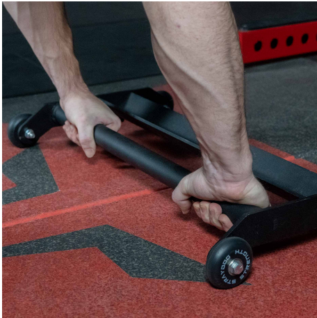
Raised up 1.325" for hands