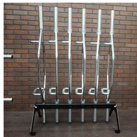
Bars don't touch ground