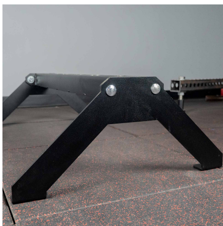
Bolt together construction