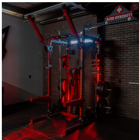
4 Individual Strips