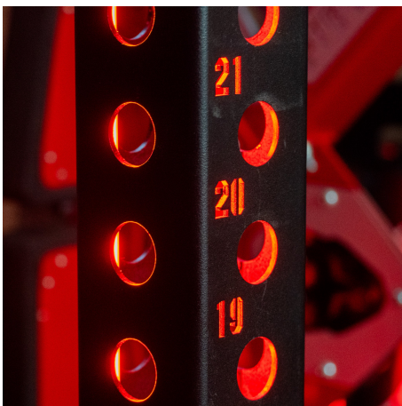
Single Color LED Light