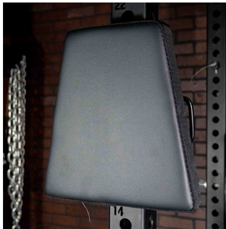
Attach to 3x3 tubing with 1" or 5/8" holes