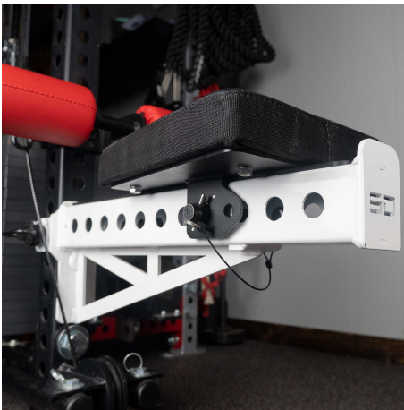
Attach to spotter arm for seat