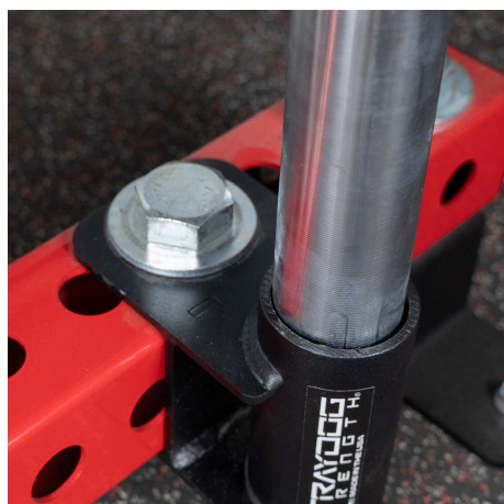
Bolt onto any 1" hole