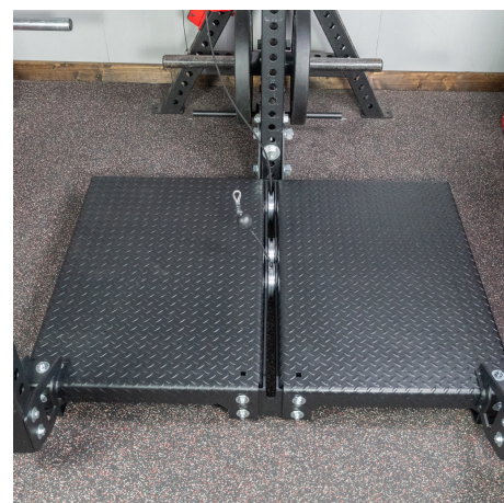
Diamond Plate Platform