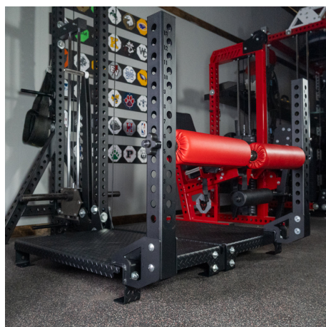
Split Squat Posts