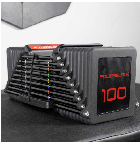
50, 100 and 125 LBS Options