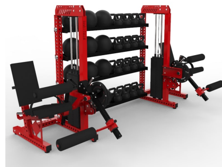
Flat or DB Trays