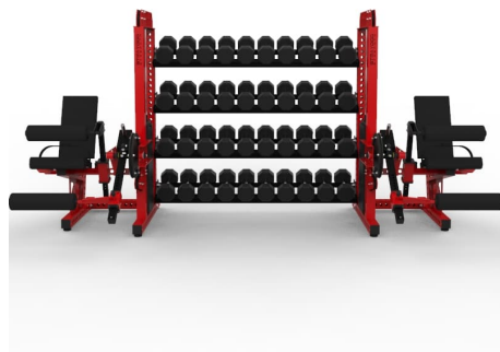
4 Rows of 72" Trays