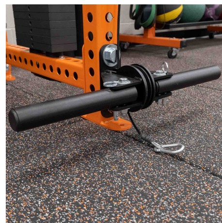
Low Pulley Can be Added