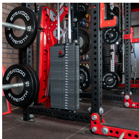
Does not Add to Footprint