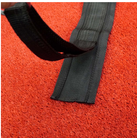
Thicker part on hip contact points