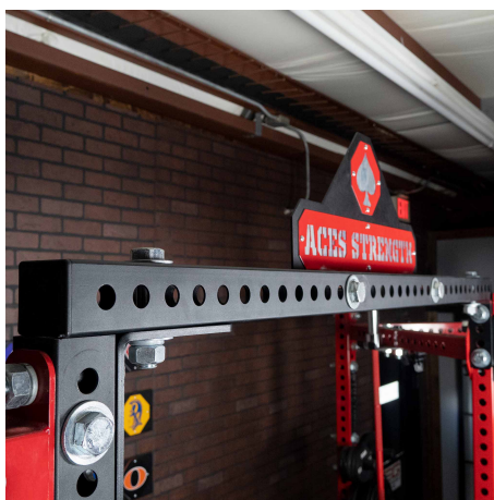
3x3 11 Gauge Steel Tube