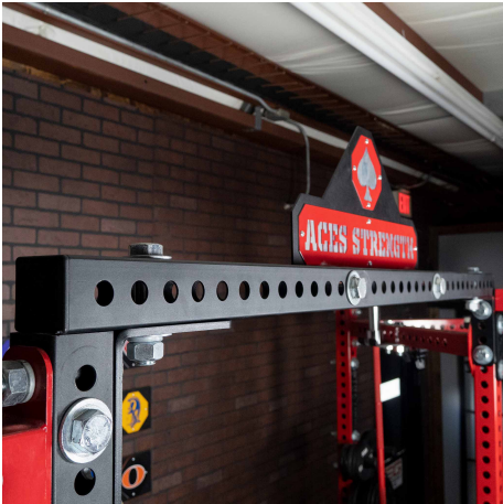
3x3 11 Gauge Steel Tube