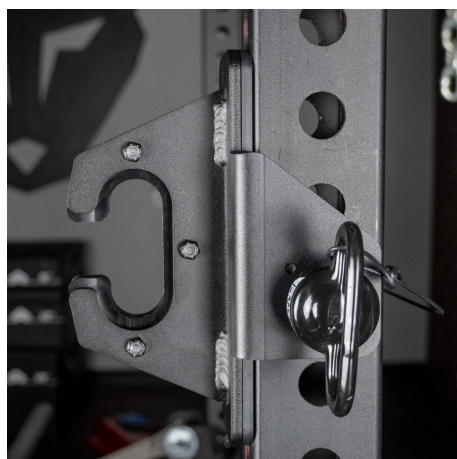
Add to any 1" Hole Rack