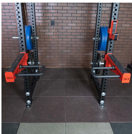
Attach To spotter arms