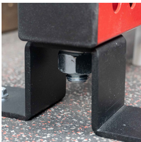
Hole for 1" Bolt