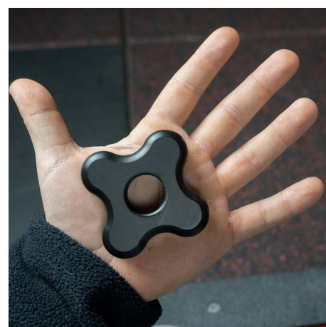
Single solid piece will not break