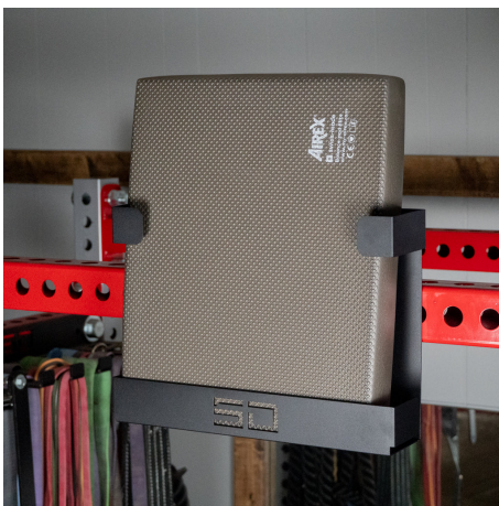
Attach To Crossmember