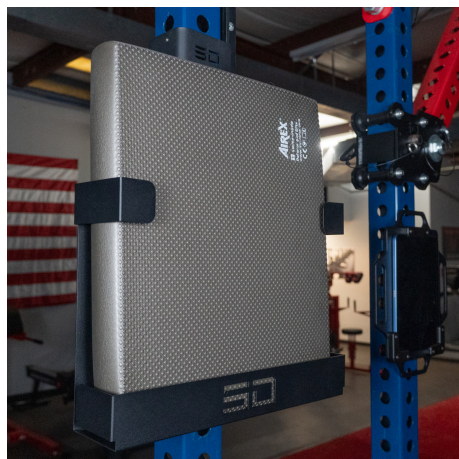
Attach To Uprights

Our Airex Pad Storage system mounts to any upright or crossmember with 1" holes, offering a clean, secure way to store Airex pads in your facility. Designed specifically for 20" x 16" x 2.5" Airex pads, this attachment keeps them off the floor and easily accessible. The compact, space-saving design helps maintain an organized training environment while protecting the pads from unnecessary wear. Included with our Pro Basketball Storage Cart or available as a standalone attachment.