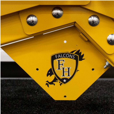
Bolt On Logo Plate