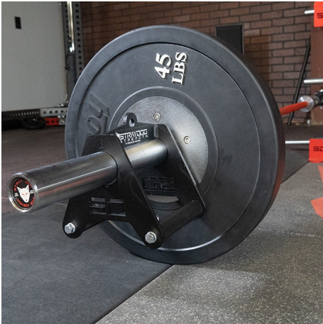
Add to Bar for Landmine Movements