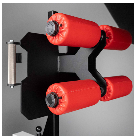
Dual Roller Footplate