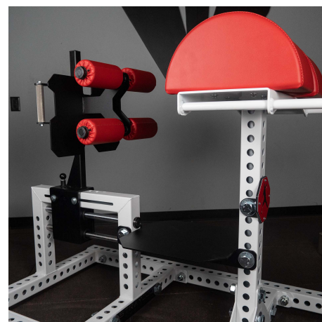
Custom Upholstery Options Available