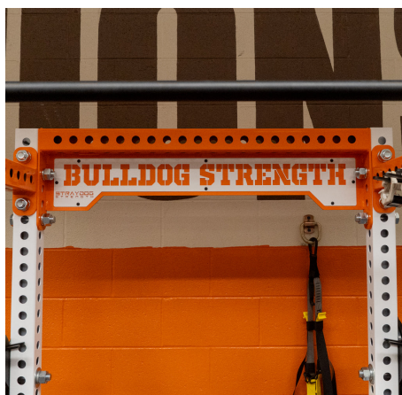
Included Custom Branding