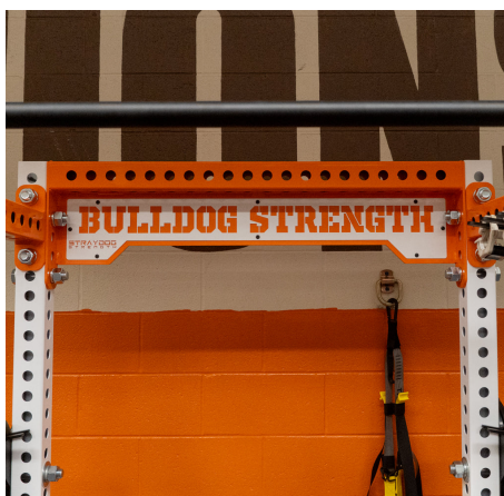
Included Custom Branding