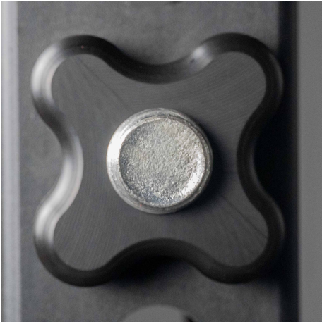
Attaches with Adjustable Nut