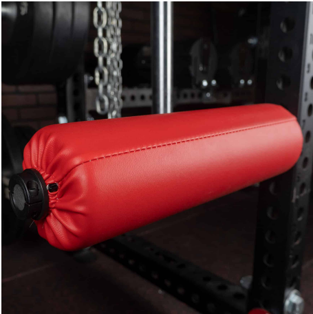
18" Long Pad