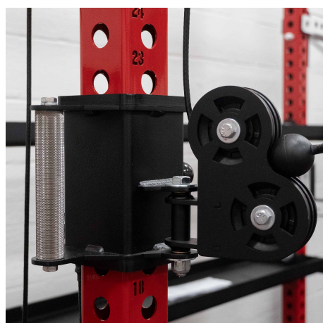
Stainless Steel Knurled Handle

Our ATR Cable Columns were designed to be connected together or connected off to the side of a rack. These units are made out of 3x3 tubing with 1" holes and 2" hole spacing all over allowing you to add attachments or bar cups for lifting. Our Functional Trainer is two ATR Cable Columns connected at 43" or 72", if you want a custom width Functional Trainer you can order 2 ATR Cable Columns and connect them at various widths. Our ATR Cable Columns can be modified down to be shorter for $250.